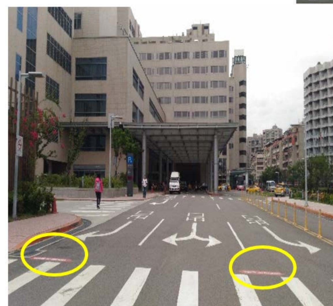
The hospital surrounding is drawn with tobacco-free line.