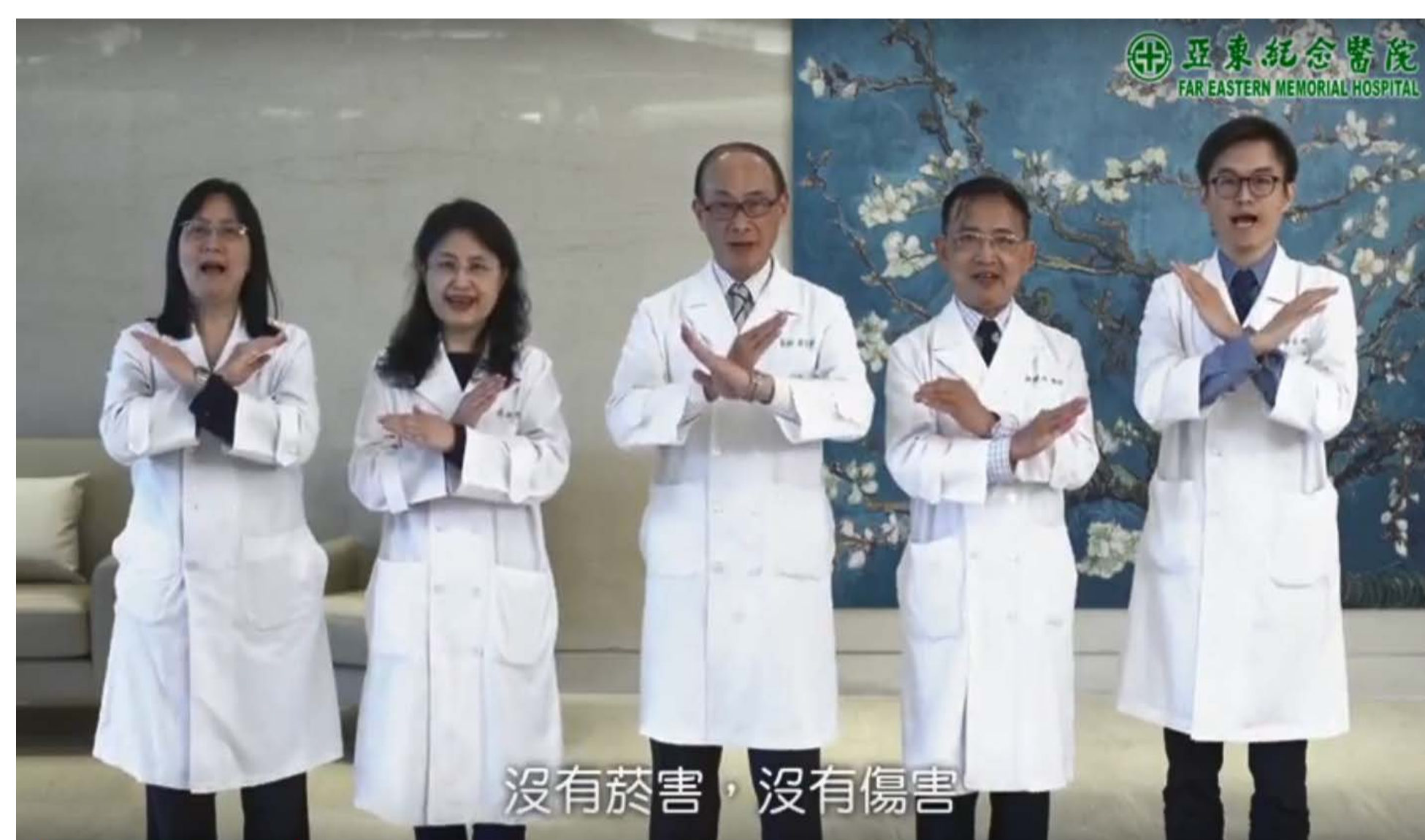
Declaration and promotional film for "No smoking, No harm" by the superintendent and deputy intendent

We re-addressing tobacco-free hospital promotion by the supervisors at the hospital affairs meeting on April 17, 2018 via the tobacco-free film.