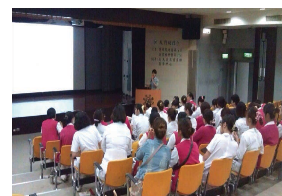
Educational training of smoking cessation for employees and hospital volunteers

We hold educational training for employees and hospital volunteers every year, and encourage physician and other health education personnel to get qualifications for providing smoking cessation service.