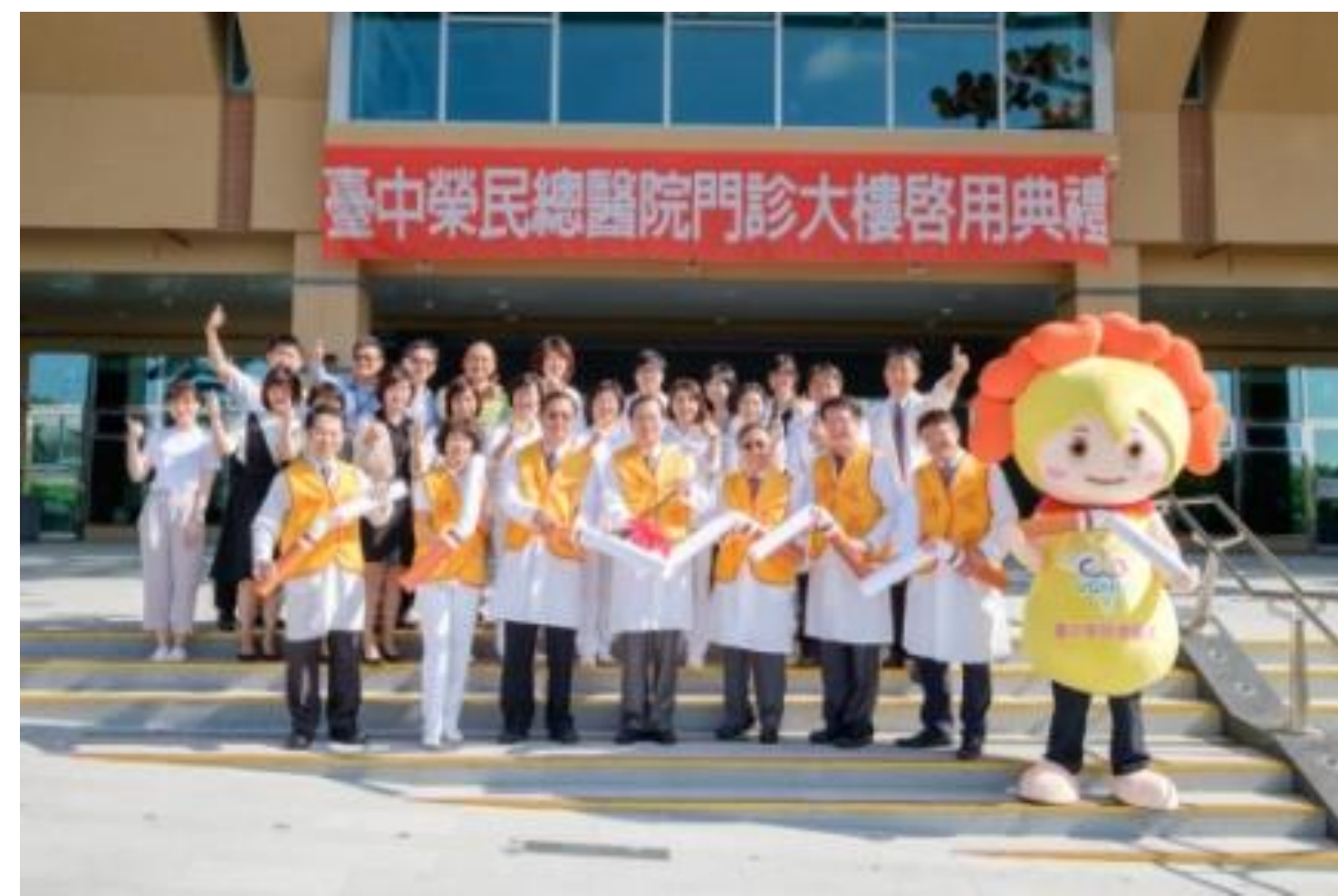
Our superintendent swear to lead the hospital to join health promotion