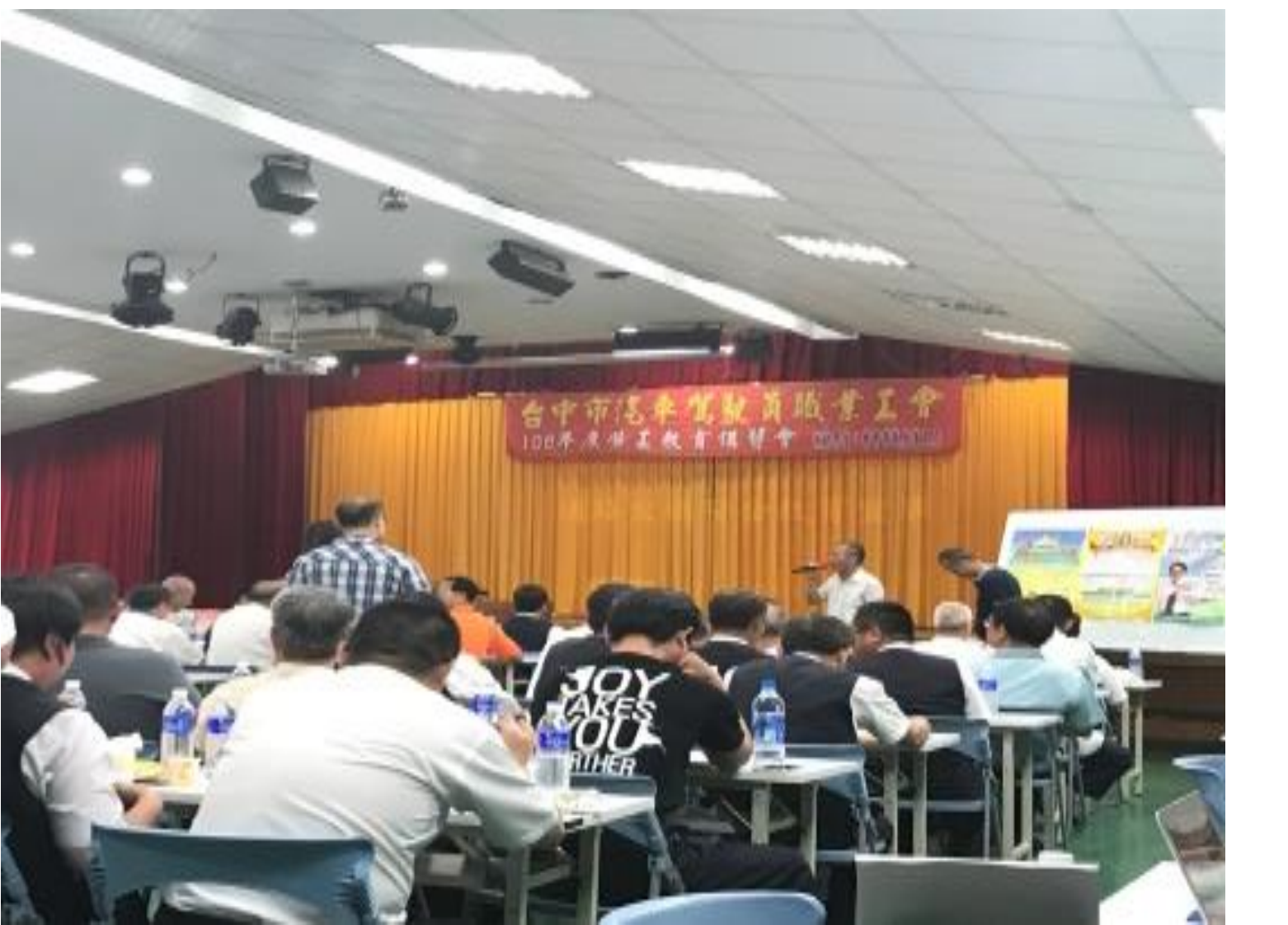
Tobacco-free lessons to taxi drivers