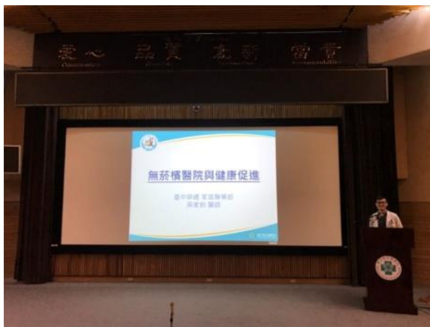
Our regular updated lesson of HPH