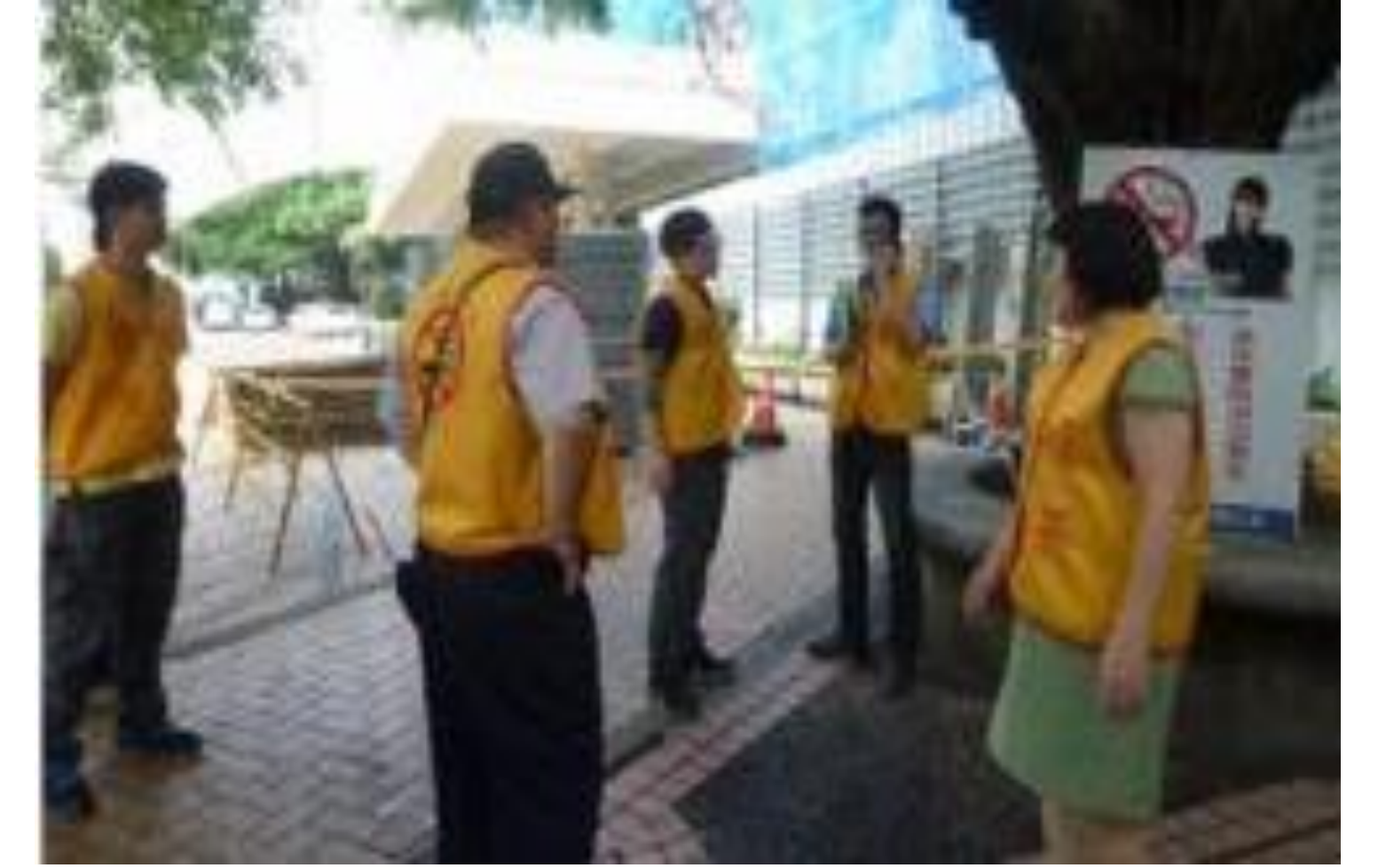
Our tobacco-free patrol team is working everyday