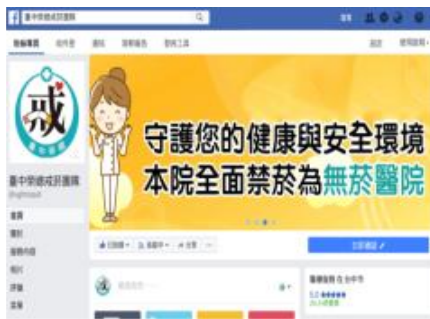
Our FB fanpage for tobacco cessation