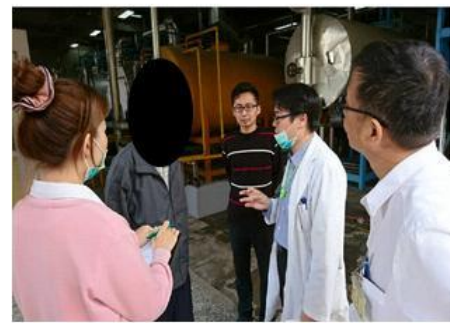
Our onsite health service visit